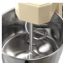
S/S bowl and shaft